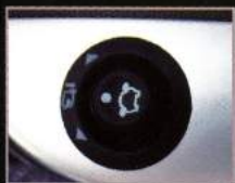
Remote Control Wing Mirror