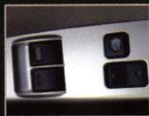
Power Window and Central Lock