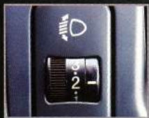
Adjustable Head Lamp