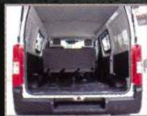
Ample Cargo Space